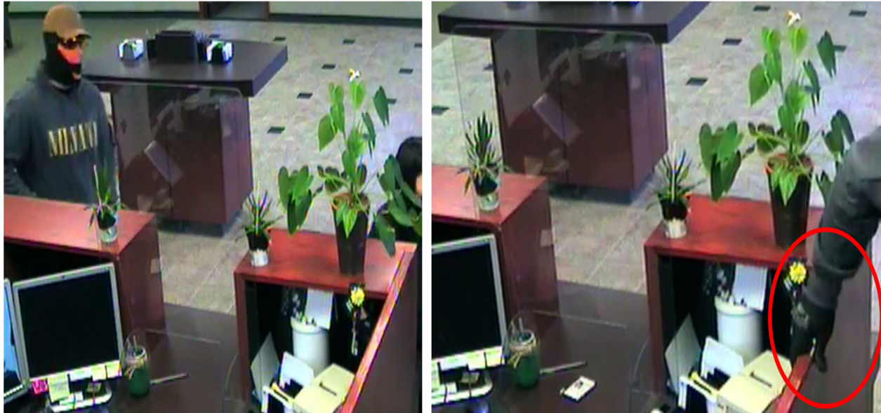
Figure 2 - Bank surveillance images from GWB robbery in Clive, Iowa, on March 2, 2022. See AFFIDAVIT IN SUPPORT OF CRIMINAL COMPLAINT ("Crim Aff."), ¶ 29. (Doc. 1-1).

recovered $1,460 in cash, as well as a black glove Babudar discarded. Id. Both this glove, and GWB Victim 1, would figure again months later in piecing together Babudar's other robberies.