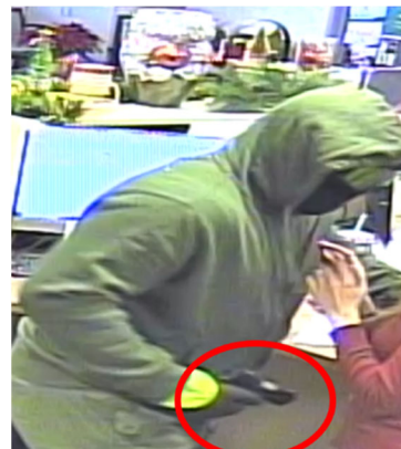
Figure 9 - Bank surveillance image from attempted robbery of TTCU in Bixby, Oklahoma, on December 16, 2022. See Crim. Aff. ¶ 9.

banking industry for almost 40 years. This was not my first robbery. However it was by far the most violent act I have ever experienced in my life ... He jammed that gun into my side so hard I thought