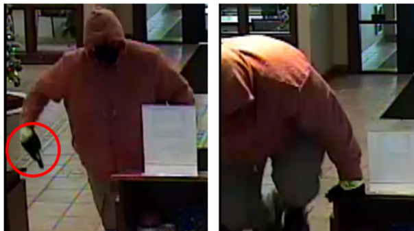
Figure 7 – Credit union surveillance images from attempted robbery of RCU in Apple Valley, Minnesota, on November 29, 2022. See Crim. Aff. ¶ 68.