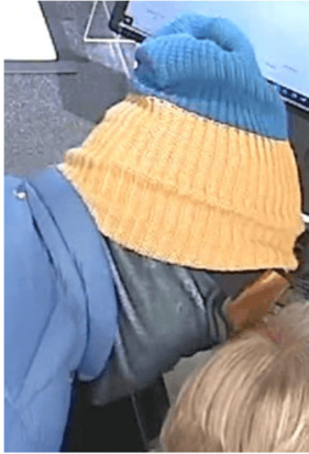
Figure 5 - Bank surveillance image from TFCU robbery in Nashville, Tennessee, on November 17, 2022. See Crim. Aff. ¶ 53.