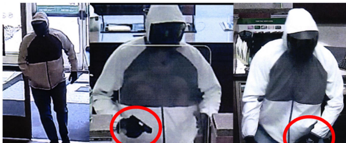
Figure 3 - Bank surveillance image from FNB robbery in Omaha, Nebraska, on April 28, 2022. See Crim. Aff. ¶ 47.

On the afternoon of Thursday, April 28, 2022, a drive-through window attendant at the First National Bank ("FNB") in Omaha, Nebraska, was doing something common to so many modern employees: watching a mandatory training video. See PSR ¶ 10. Unfortunately for the attendant, this training – for what to do during a bank robbery – shifted in seconds from trite to terrifying. Because when the attendant looked up from her screen, she saw a coworker holding her hands up, and saw