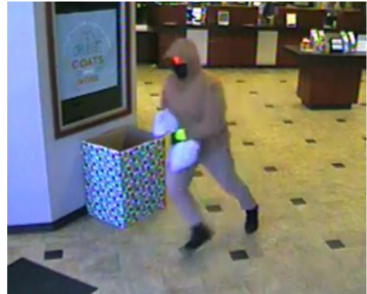
Figure 8 – Bank surveillance image from attempted robbery of FIB in Clive, Iowa, on November 30, 2022. See Crim. Aff. ¶ 74.