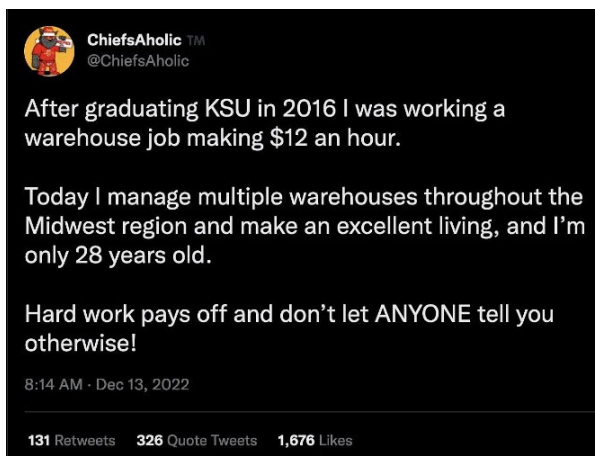
Figure 10 - Screen capture of defendant's Twitter post, which he published three days before his arrest in Bixby, Oklahoma.